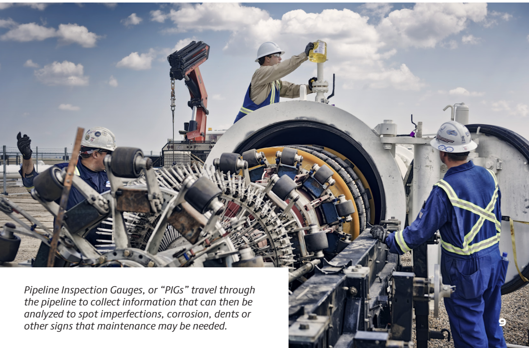
Pipeline Inspection Gauges, or "PIGs" travel through the pipeline to collect information that can then be analyzed to spot imperfections, corrosion, dents or other signs that maintenance may be needed.

In accordance with federal regulations, some segments along TC Energy's pipelines have been designated as High Consequence Areas (HCAs) where extra precautions are taken, known as Integrity Management Programs (IMPs). For information regarding these measures, contact TC Energy at public_awareness@tcenergy.com .